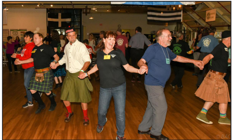
Ceili dancing at the Samhain Festival

Snapshots from the Samhain Celtic New Year Festival October 27, 2018 at Willamette Heritage Center Visit www.celticfestival.info for more photos