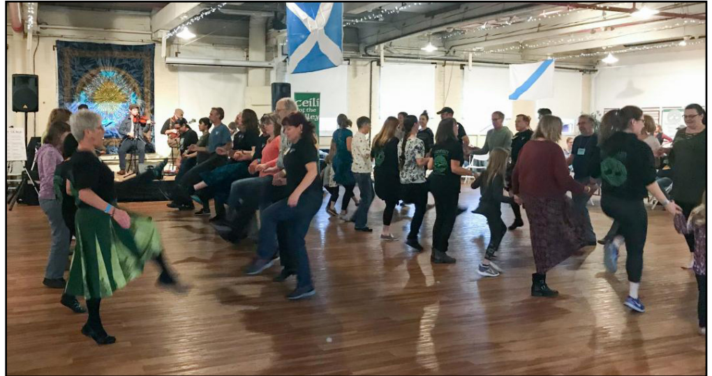
Ceili dancing at the Samhain Festival