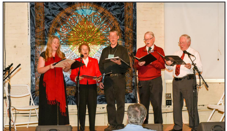
Welsh Society of Oregon Chorus