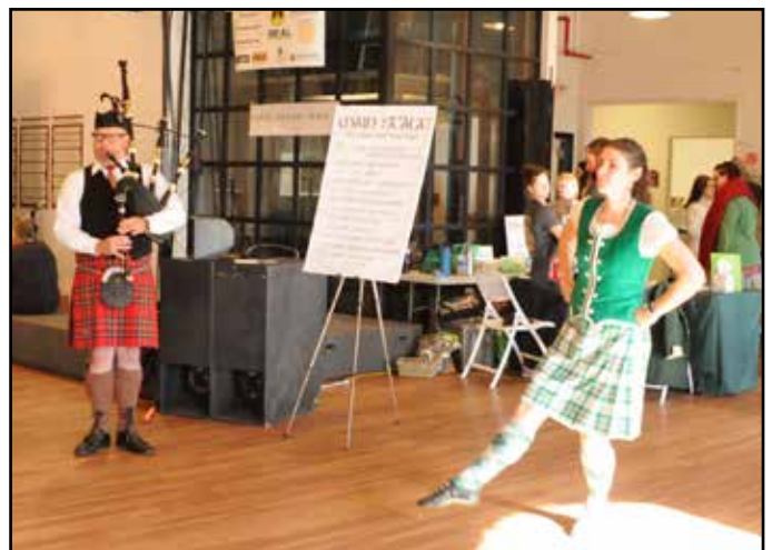
Highland dance with bagpiper at Samhain Festival