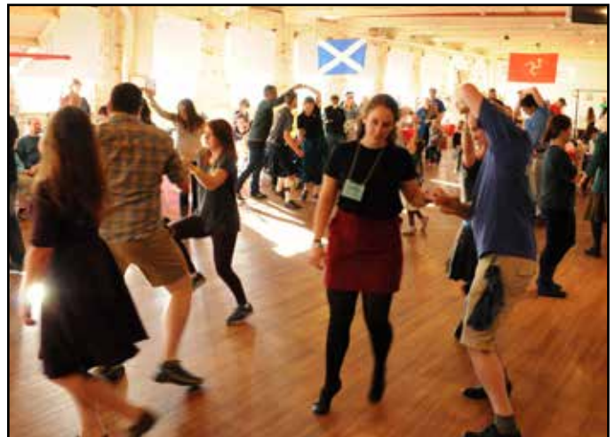
Ceili finale at the Samhain Festival