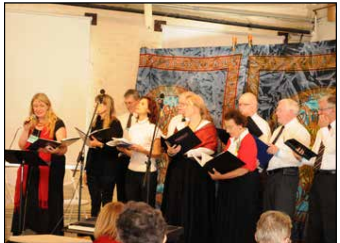
Welsh Society of Oregon at Samhain Festival