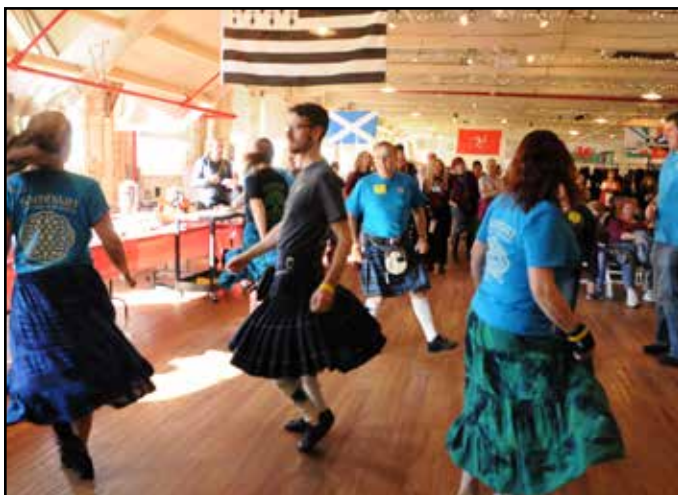
CVS demonstrating ceili dance at Samhain Festival

Our involvement in the Salem Art Fair brought a new opportunity for us. We “got art.” Ceili members shared information about our group as they applied Celtic knot temporary tattoos to those who wanted them. It was such a success! That thirty seconds to set the tattoo allowed for conversation about Celtic culture and our group. One woman in her 80s requested one. She had never had a tattoo before; she was pleased to be sporting her first. Another person decided she wasn't going to wait until she was 80 to get her first. It's excitement like that that Ceili of the Valley generates.