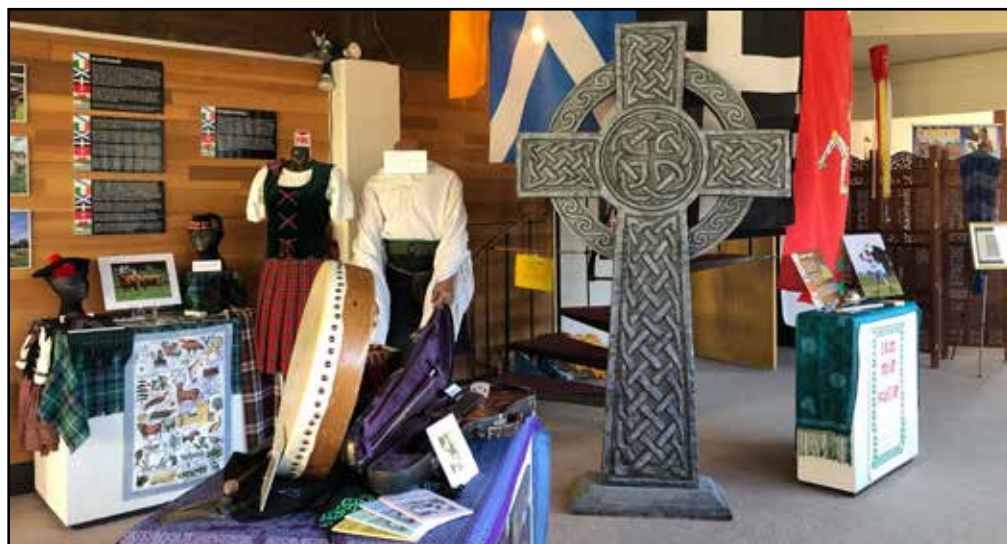
CVS exhibit "Slainte" at World Beat Gallery