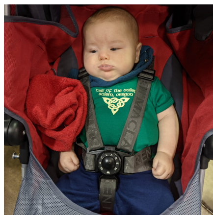
The Littlest Ceili Supporter