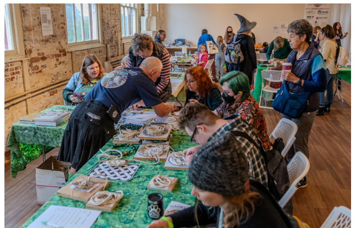
Craft area at Samhain Festival