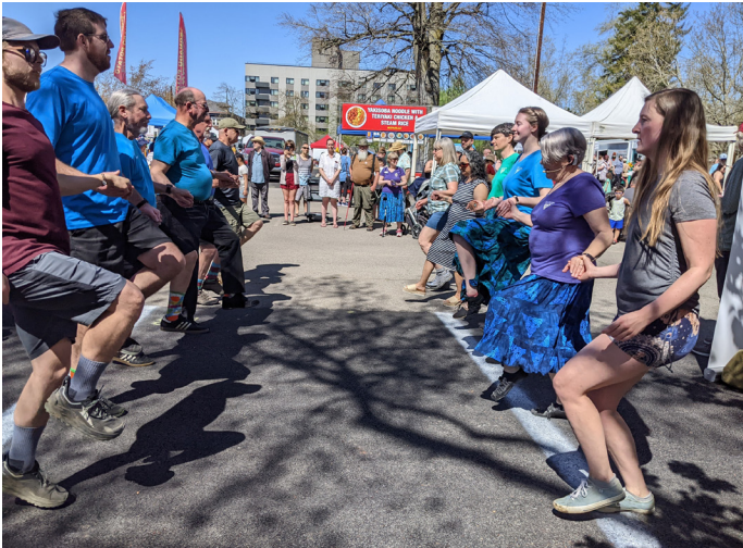
at Salem Saturday Market