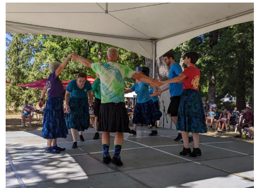
at the World Beat Festival