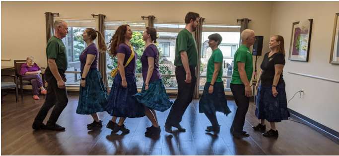
at Boon Ridge Memory Care