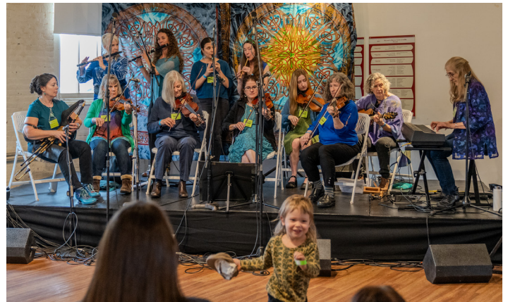
Two Rivers Céilí Band at Samhain Festival