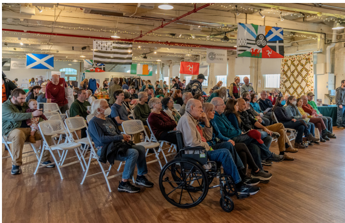
Audience at Samhain Festival