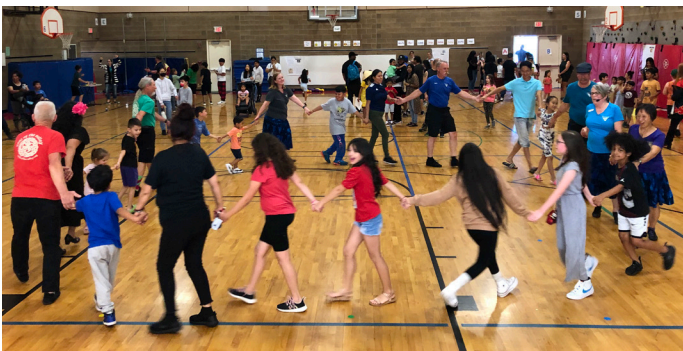
at Hammond Elementary School