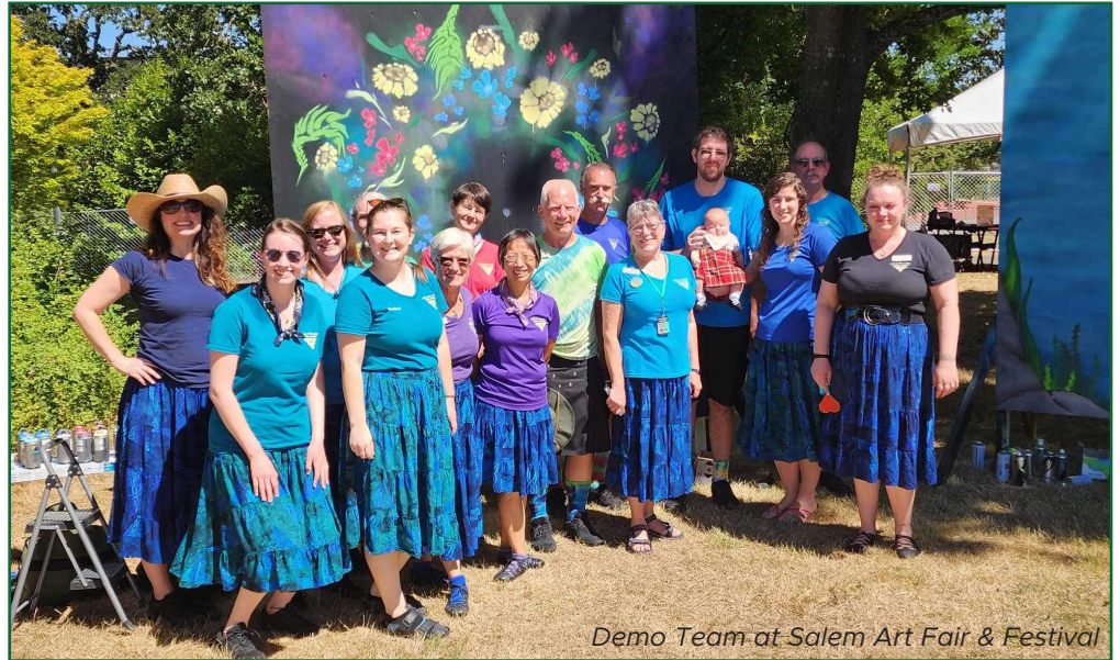
Demo Team at Salem Art Fair & Festival