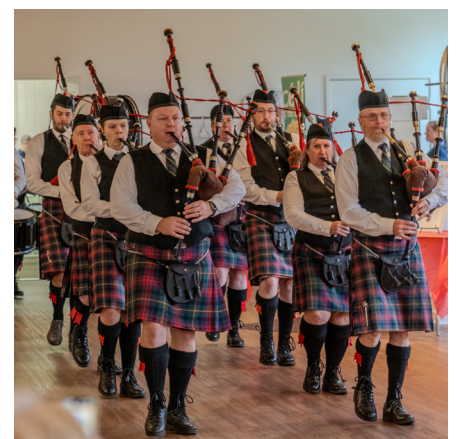
Pipers at Samhain Festival