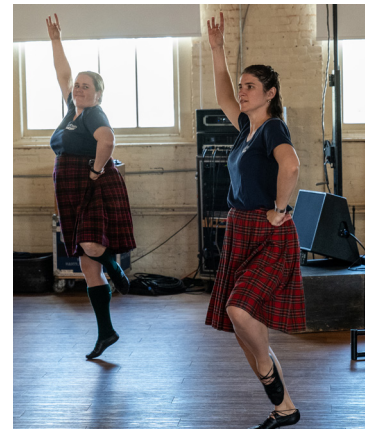
Samhain Celtic New Year Festival