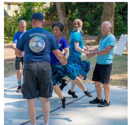
Englewood Forest Festival