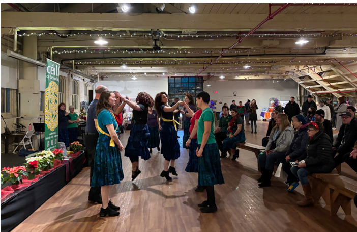
Magic at the Mill