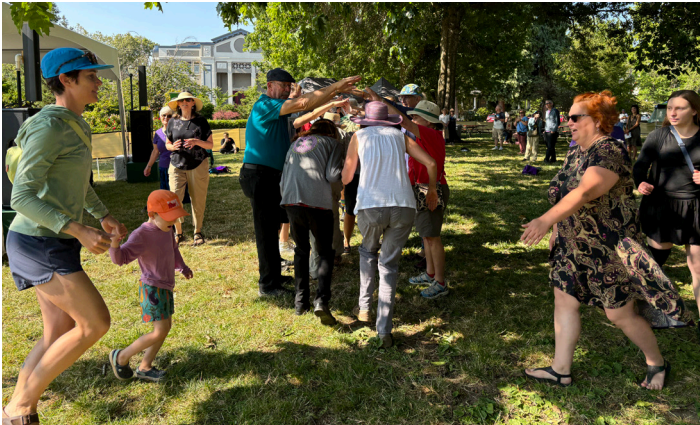
Corvallis Celtic Fest