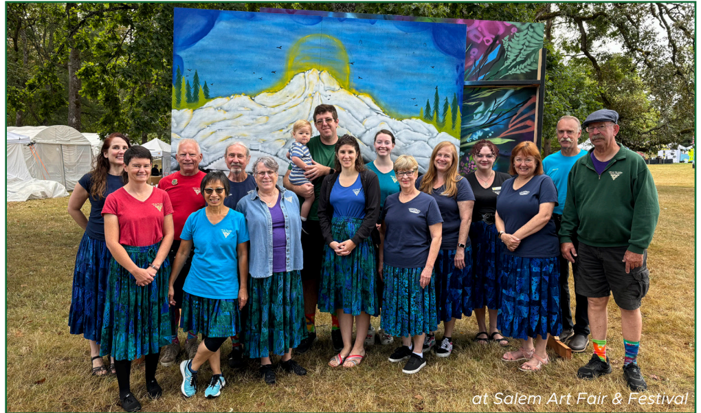
at Salem Art Fair & Festival