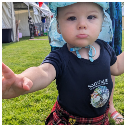
The Littlest Ceili Supporter