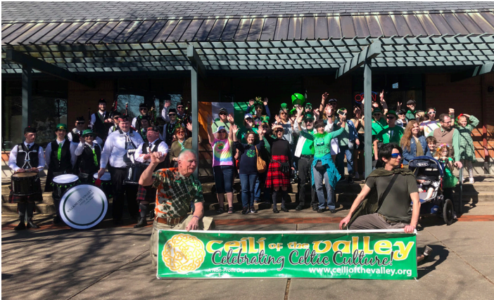
St. Patrick's Walk-About