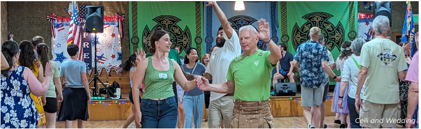
Ceili and Wedding