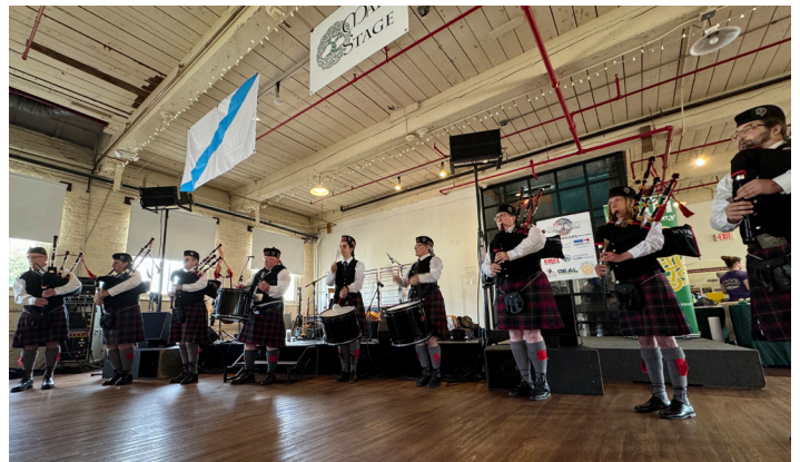
Willamette Valley Pipes & Drums at Samhain Festival