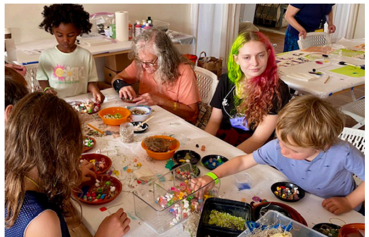
Kids craft area at Samhain Festival.