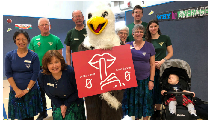
at Scott Elementary School