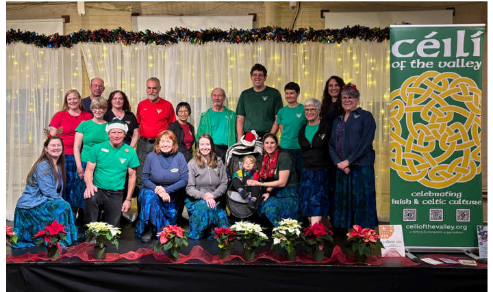
Magic at the Mill