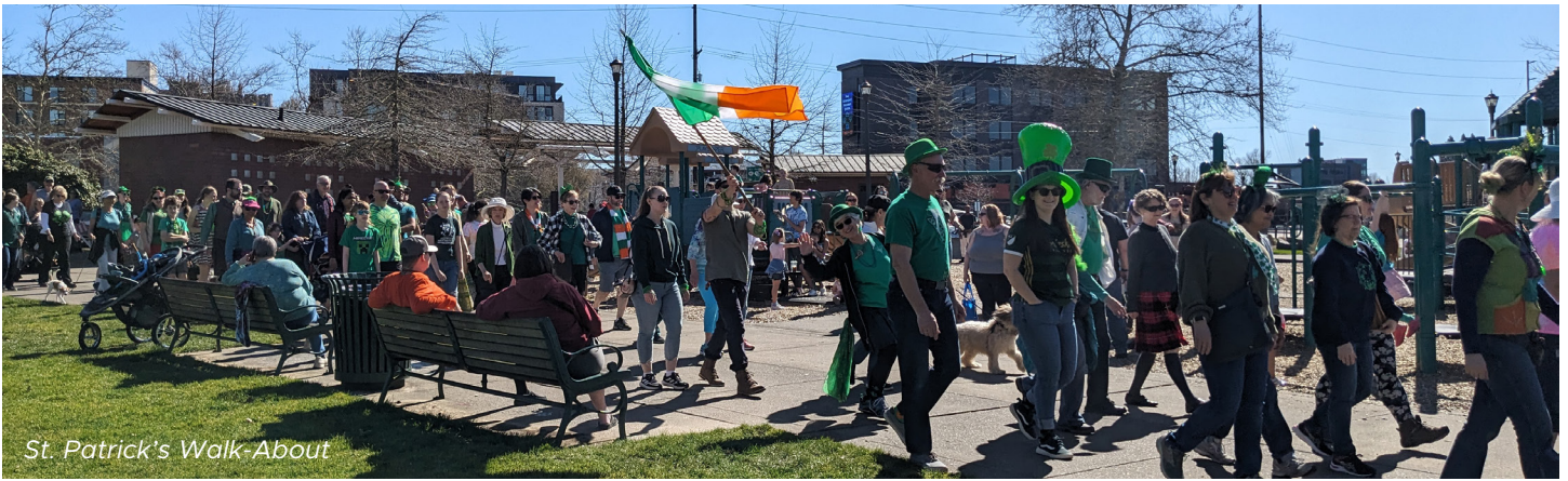
St. Patrick's Walk-About