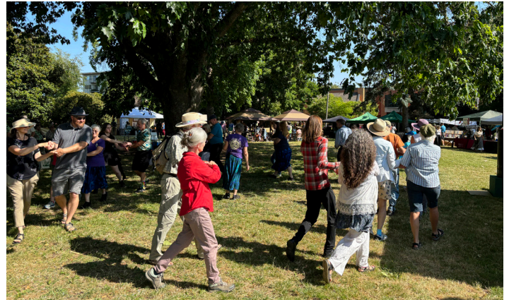
Corvallis Celtic Fest