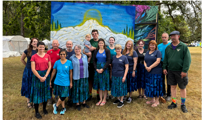
at Salem Art Fair & Festival