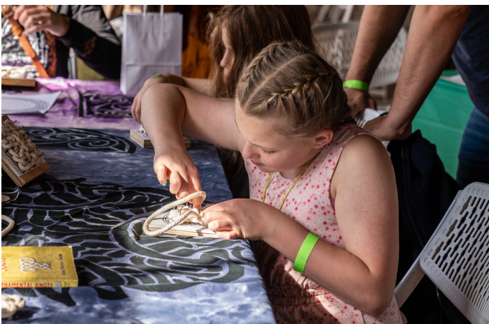
Knot making at Samhain Festival.