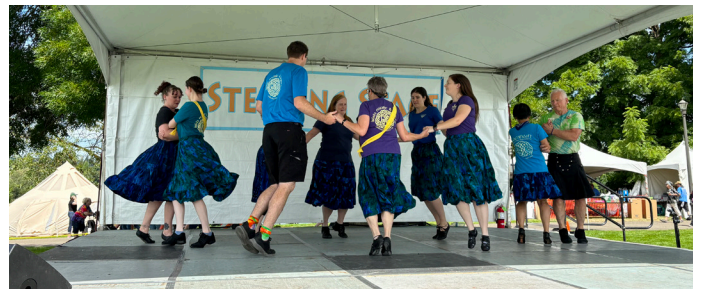
at World Beat Festival